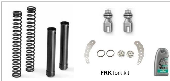
FRK fork kit